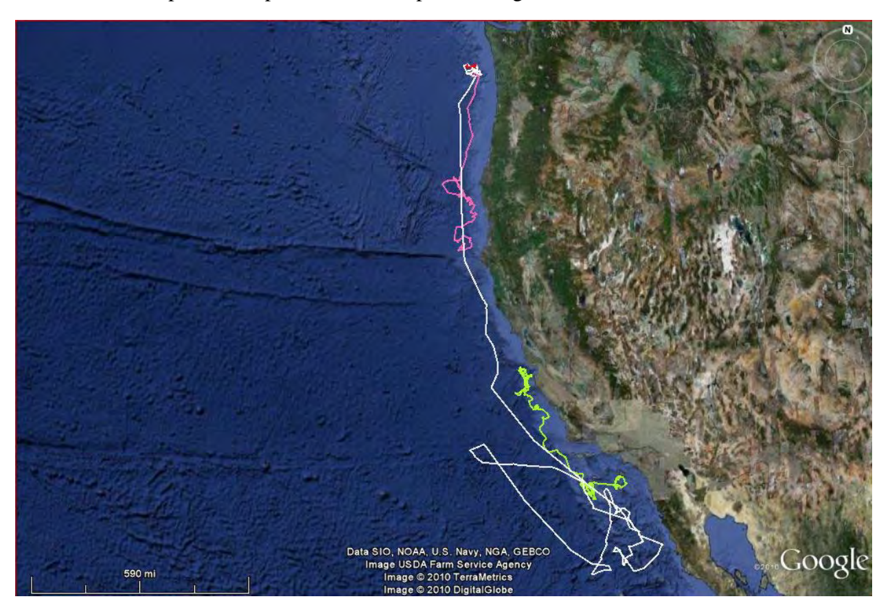
Figure 1. Map showing locations of tagged individuals. Bp 17 is represented by the red track (mostly obscured off the WA coast by movements of Bp 18 and Bp20), Bp 18 is represented by the white track, Bp 20 is the pink track, and Bp 21 is the green track.